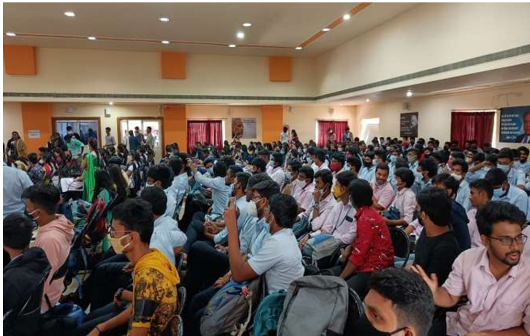
Around 310 Students from all Departments of the College Attended the Event as Audience