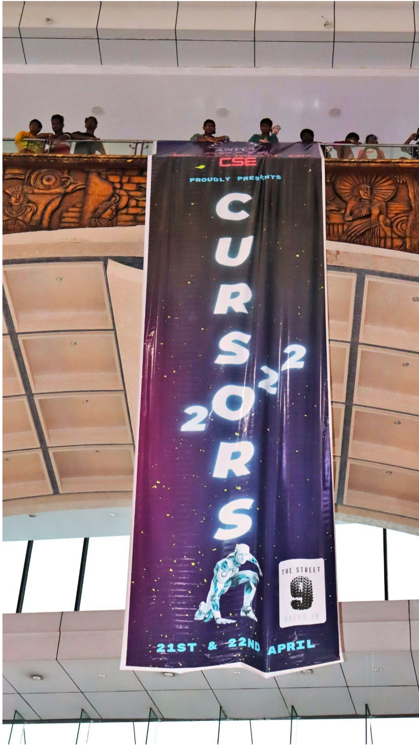
CURSORS 2022-TECHNICAL FEST BANNER LAUNCH