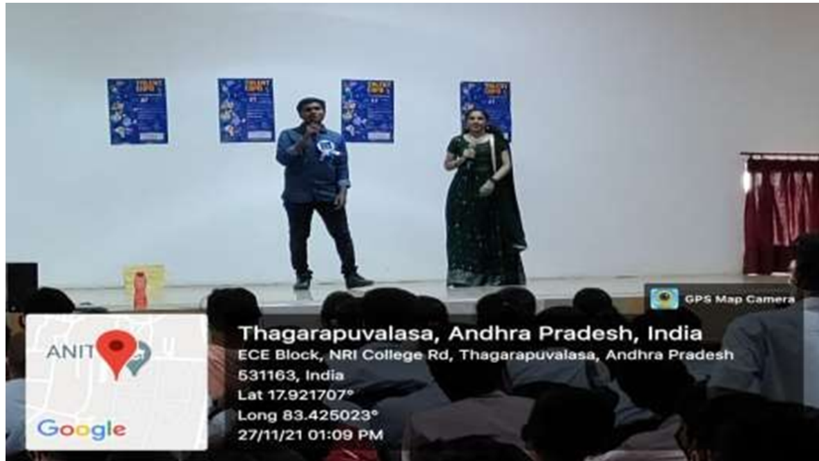
Students started the event by Welcoming the Faculty and Participants and the Audience