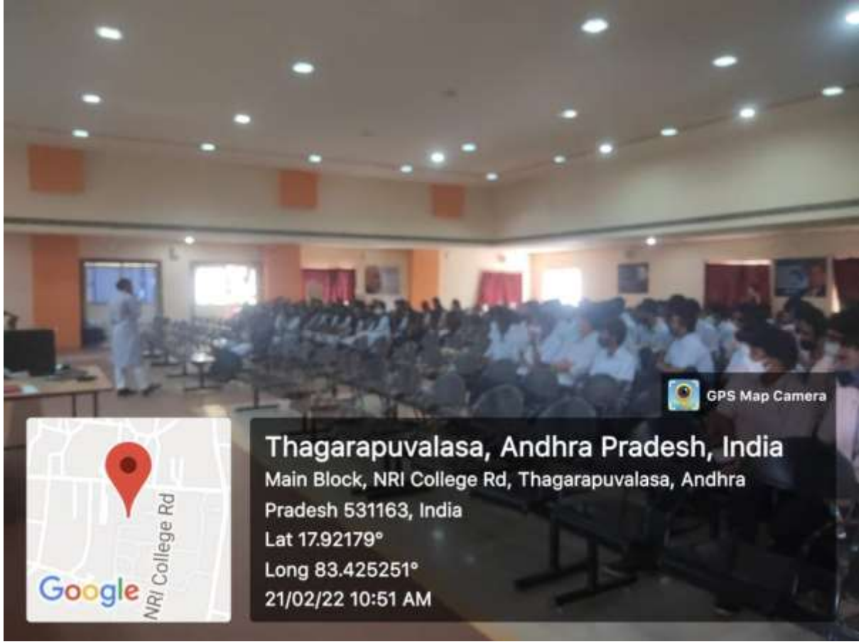
Students at "దేశ బాష లందు తెలుగు లెస్స" event