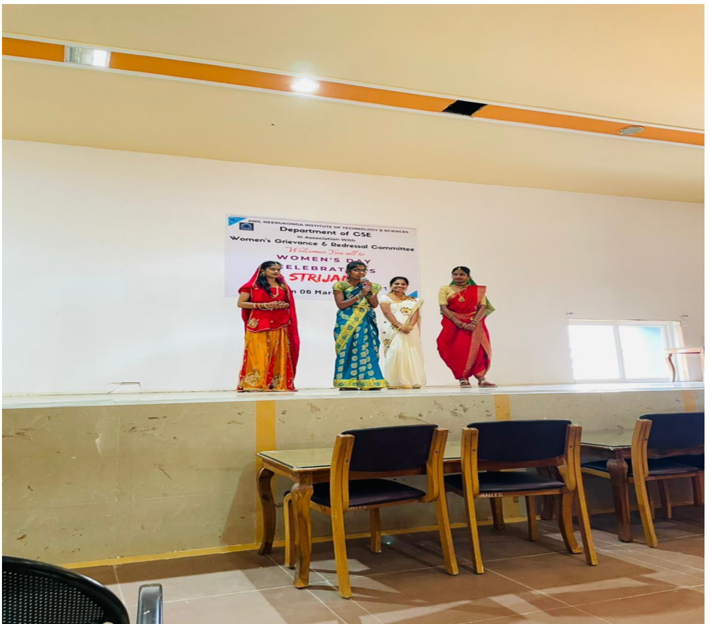
State/Culture Event where participants representing a State from our country.

This Culturals Event is conducted for the Girl Students of ANITS where State Culture/Traditional Event is conducted ,for representing different state culture and tradition of each state .Girl Students participated actively in this event and each participant represented one State like Kerala, Gujarat, Maharashtra, Andhra Pradesh etc Students also actively performed Dancing and Singing. The Prizes for this event were distributed to the Prize winners on 8 th March 2021. This Cultural Event is Entry fee based where audience( Girl Students & Women Faculty) must pay before entry. This amount collected is driven to Together We Can Club. This is purely a Fund Raising Event.