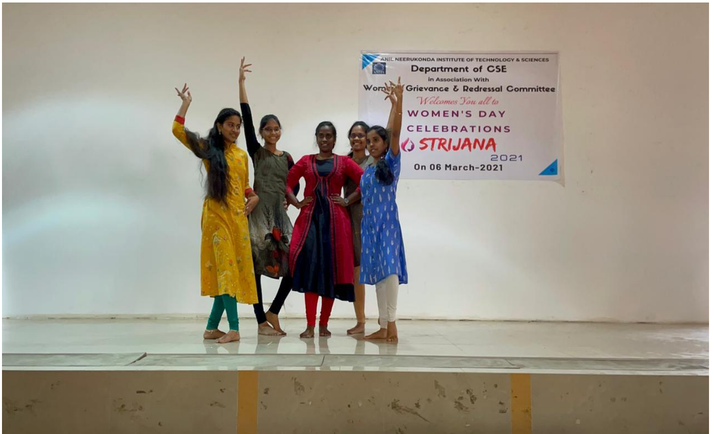
Girl Students actively showing their Dance Performance