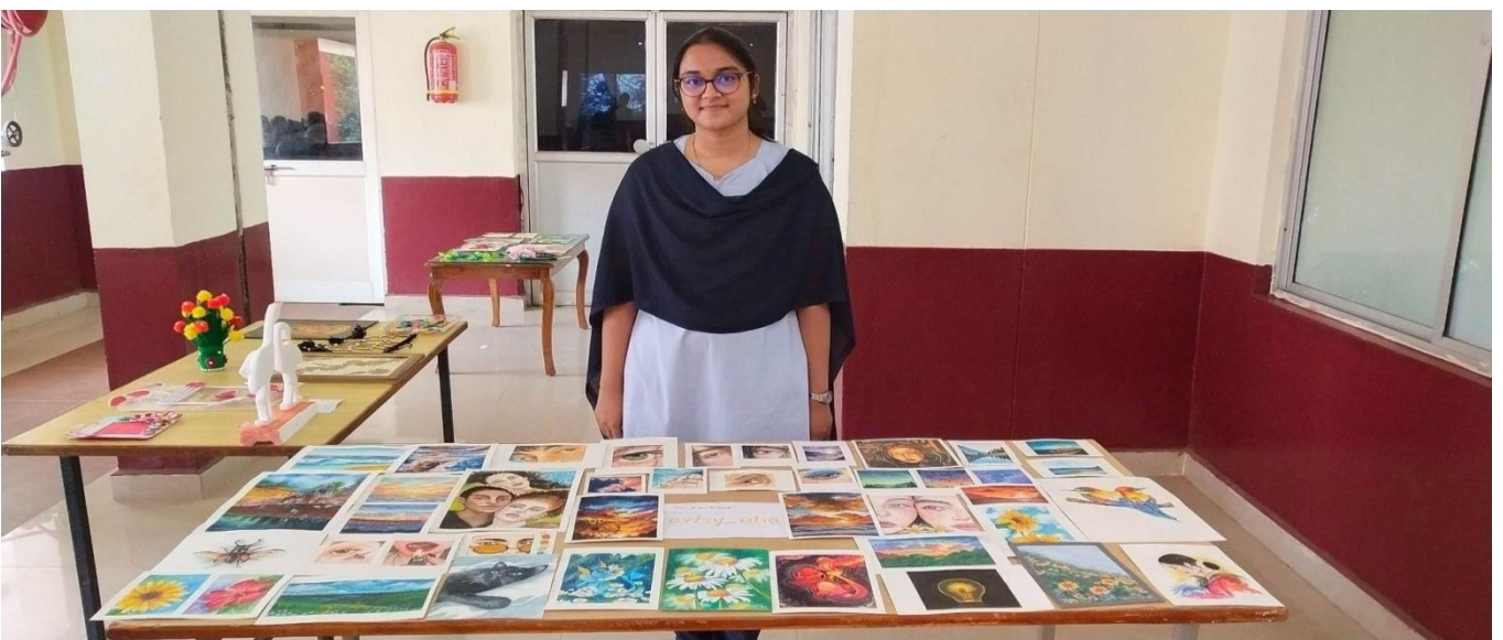
Principal-ANITS, HoD-CSE along with faculty and students at Handicrafts Exhibition cum Sale