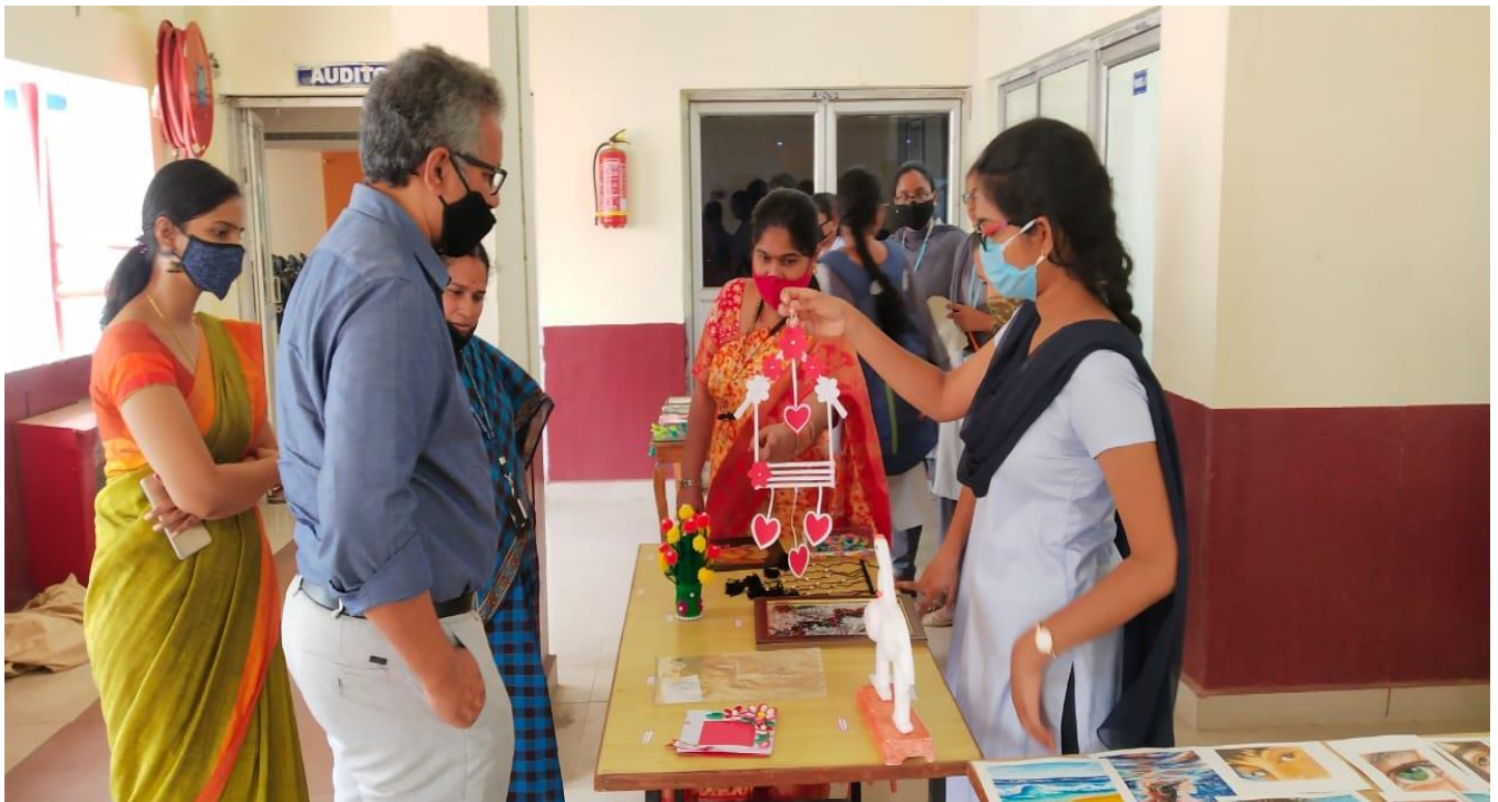
Participants showing their work to Principal, HoD, CSE Faculty of ANITS