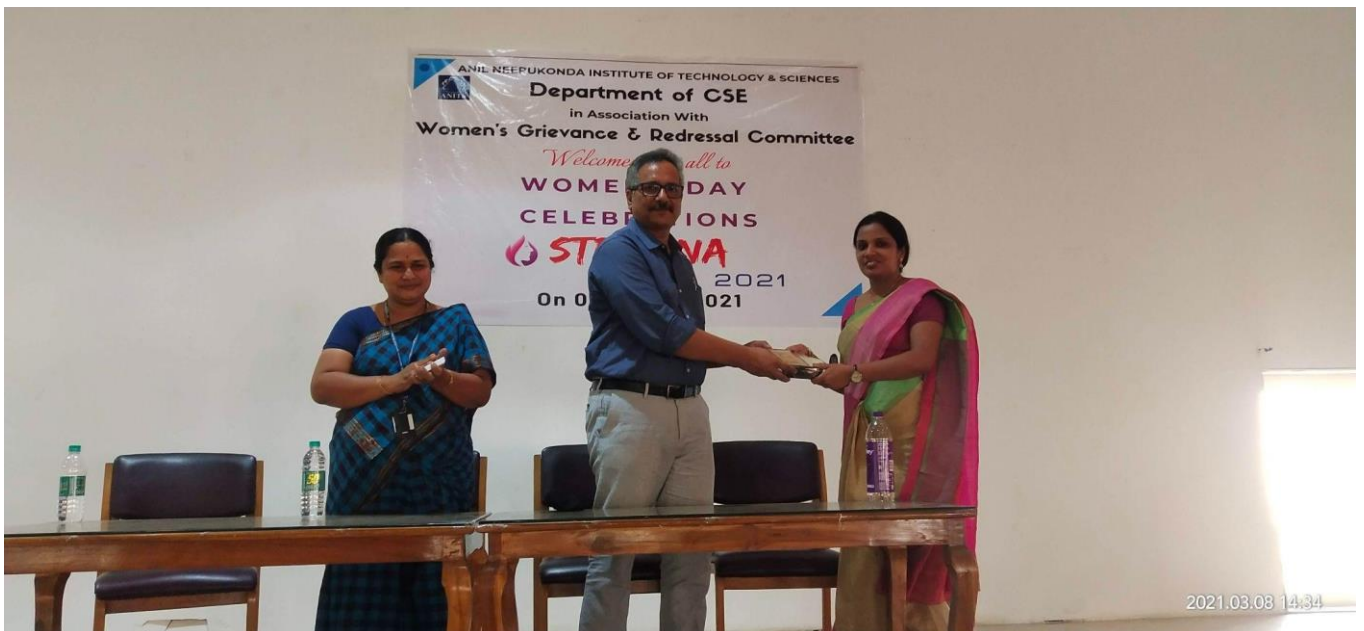
Prizes distributed for various events to both Girl students & Women faculty