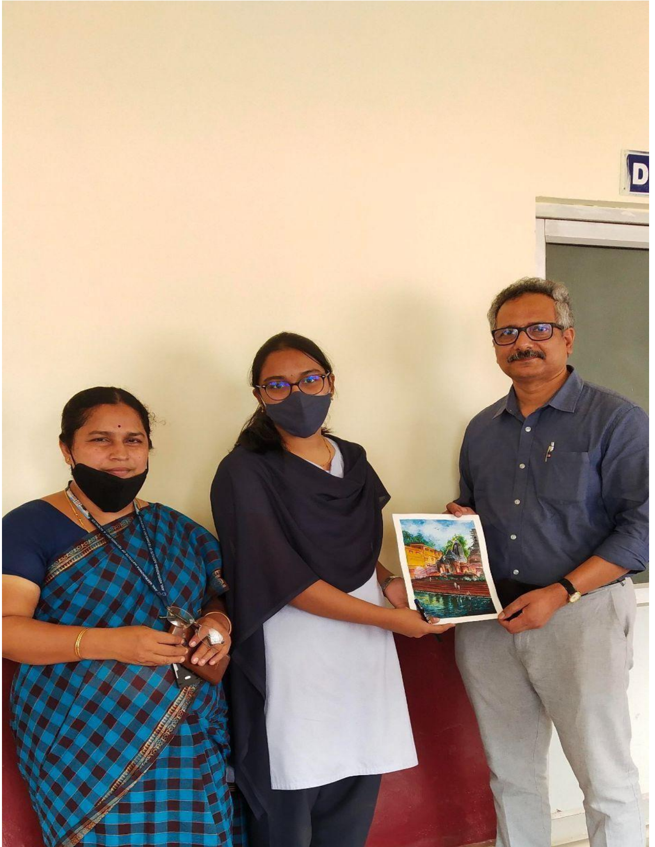
Principal, ANITS and HOD, CSE dept with 1 st year CSE student who is holding her hand painting