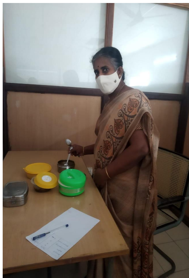
Judges tasting the variety of dishes cooked by the participants