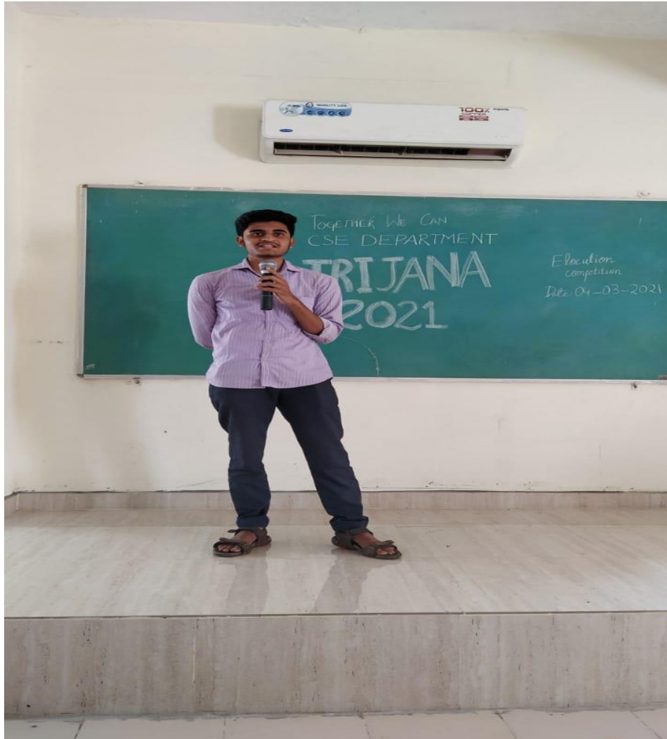
Boy Participants actively sharing their thoughts on the Elocution Topic: GENDER EQUALITY