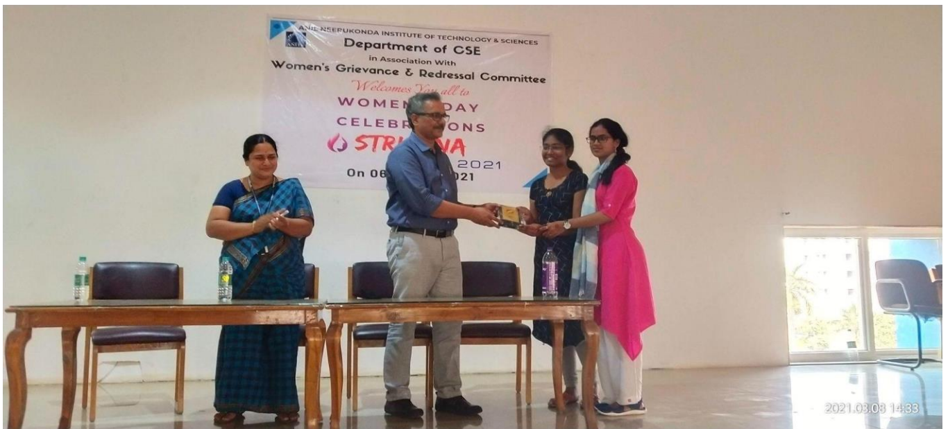
Prizes distributed by Principal & HoD, CSE dept, ANITS