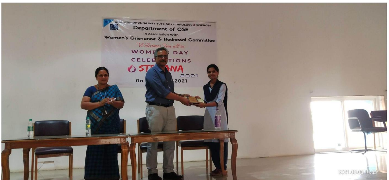
1 st Prize Winner receiving the Prize for Elocution Competition from Principal, ANITS on 8 th March 2021