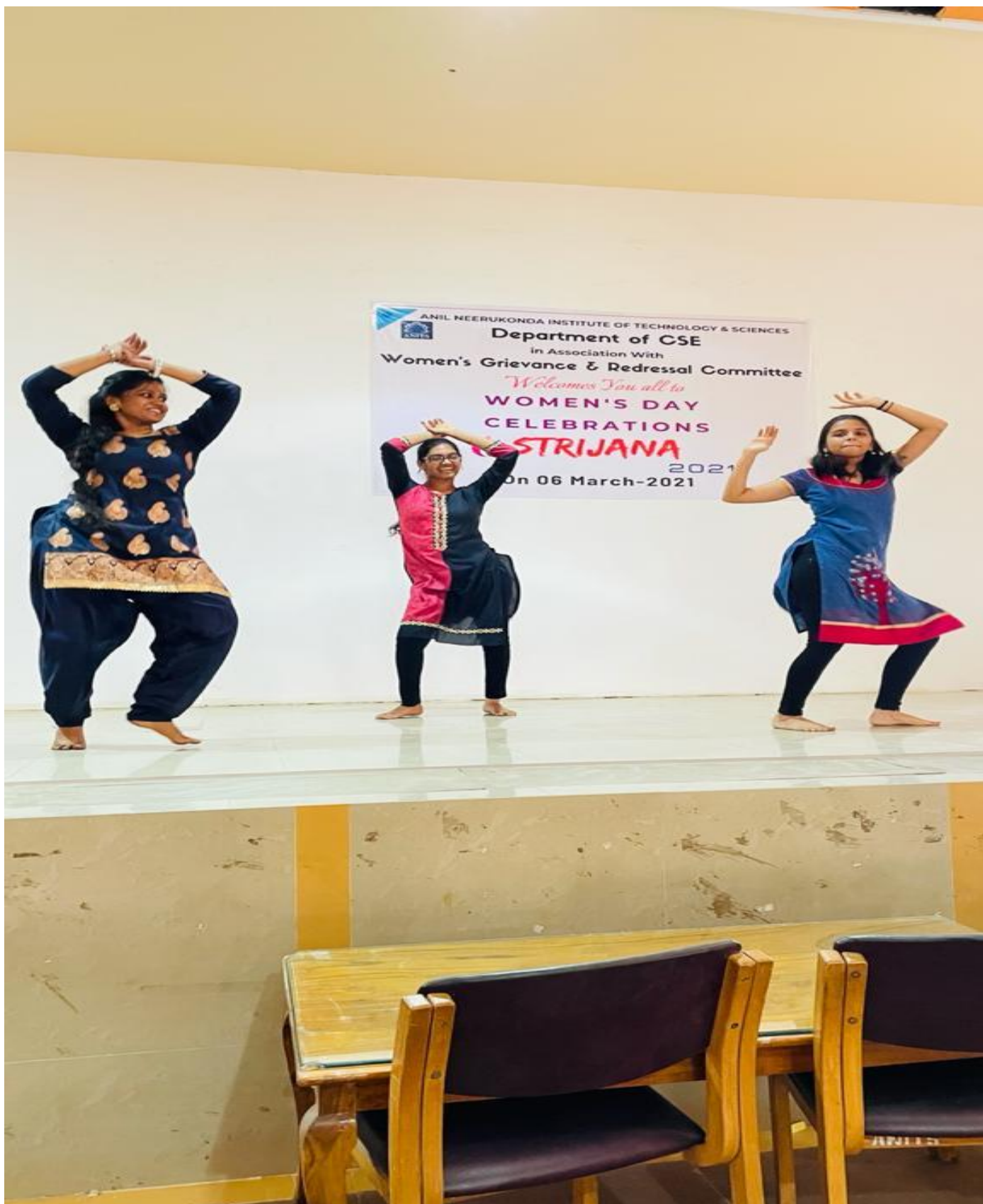
Girl Students showing up their Dancing Talent